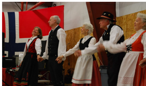
The International Folk Dancers