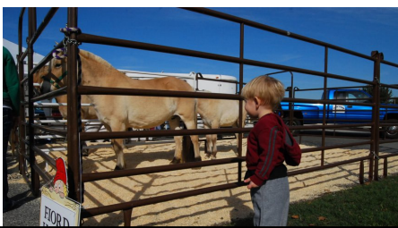
The Fjord Horses were very popular!