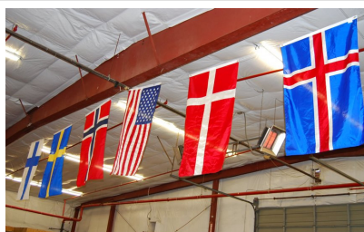
Flying the flags with pride!