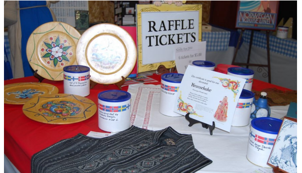
Our raffle was very popular and successful!