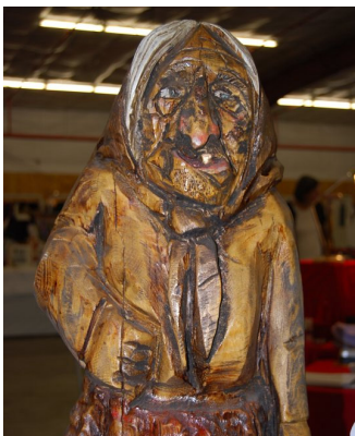
Some guests were obviously stunned by the fantastic displays!