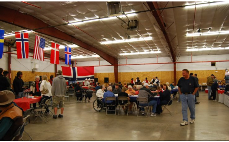
Look at the crowd! We were filled to the gills the first day!