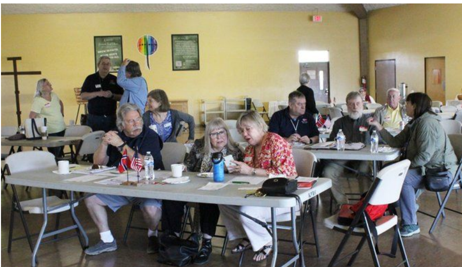
The Zone 5 meeting was attended by members of Zone 5 lodges as well as District and International officers.