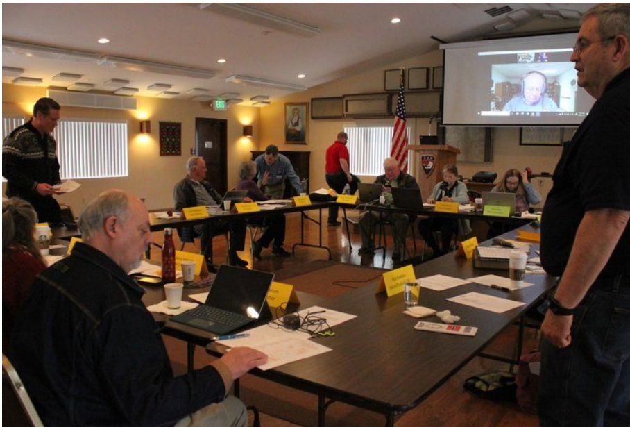
District 2 board members met in Bothell on April 22.